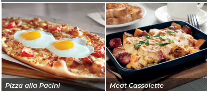
Pizza alla Pacini