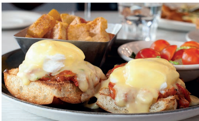
All'italiana Eggs Benedict