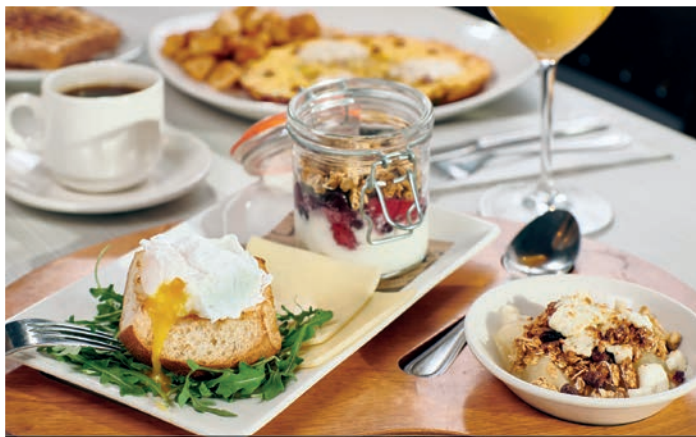
Little Healthy Pleasures