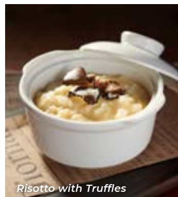
Risotto with Truffles