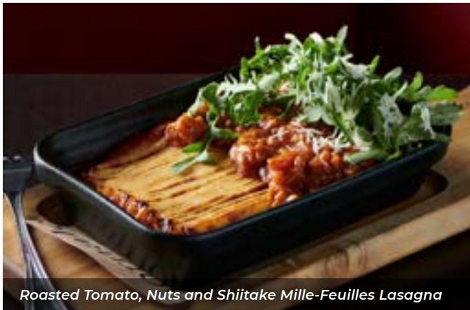
Roasted Tomato, Nuts and Shiitake Mille-Feuilles Lasagna