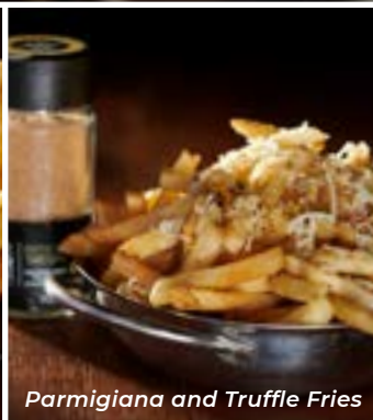
Parmigiana and Truffle Fries