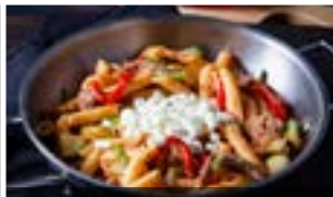
Penne with Duck Confit