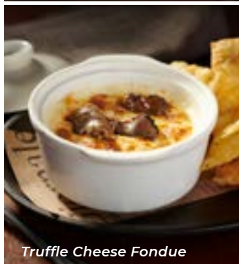
Truffle Cheese Fondue