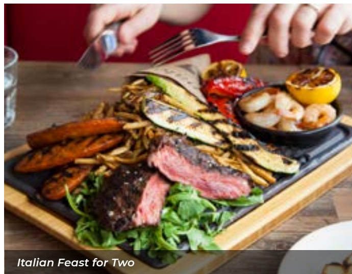
Italian Feast for Two

Prefer gluten-free? To accompany all these grilled dishes (except the Italian Feast for two), in addition to grilled vegetables, replace the fries or linguine with crouton-free Caesar salad or kale al limone salad, or balsamic vinegar glazed vegetables.