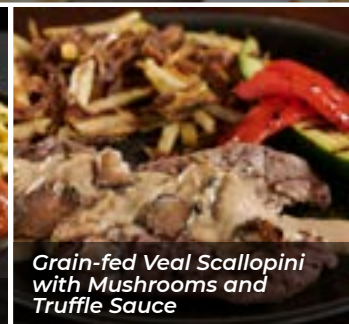
Grain-fed Veal Scallopini with Mushrooms and Truffle Sauce