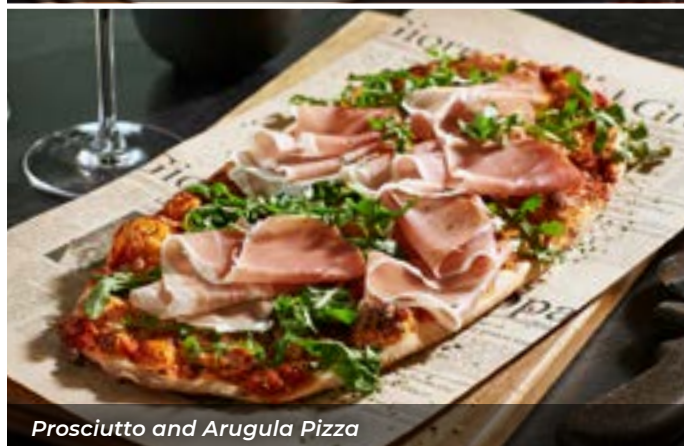
Prosciutto and Arugula Pizza