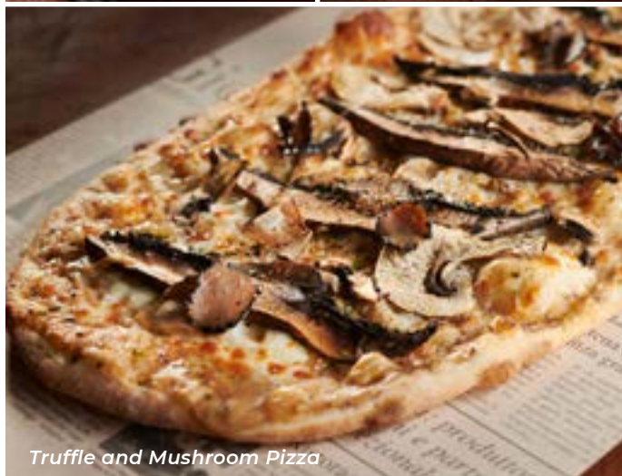
Truffle and Mushroom Pizza