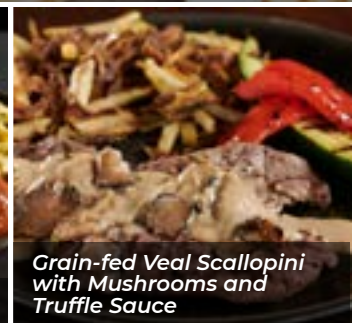
Grain-fed Veal Scallopini with Mushrooms and Truffle Sauce