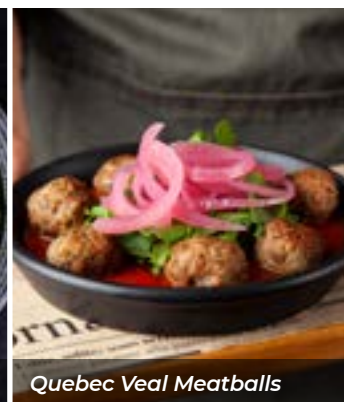
Quebec Veal Meatballs