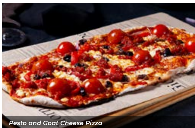
Pesto and Goat Cheese Pizza