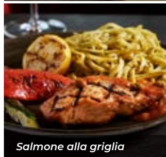
Salmone alla griglia