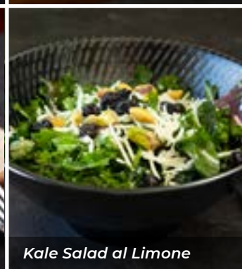
Kale Salad al Limone