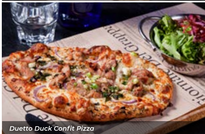
Duetto Duck Confit Pizza