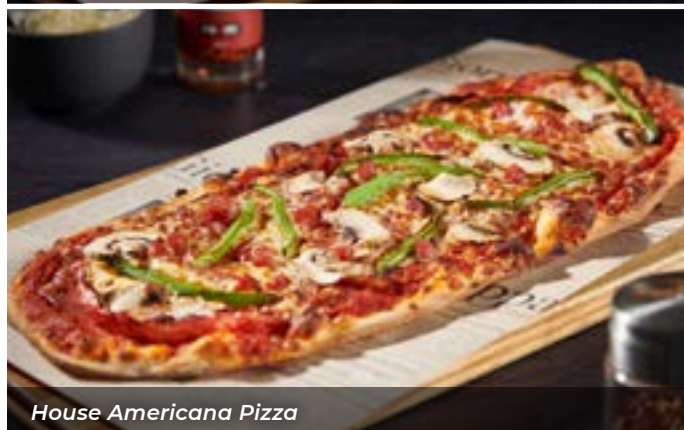
House Americana Pizza