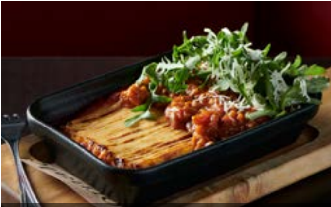
Roasted Tomato, Nuts and Shiitake Mille-Feuilles Lasagna