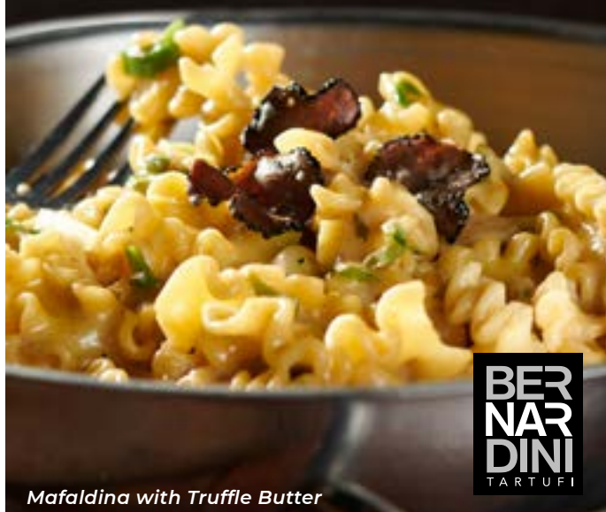
Mafaldina with Truffle Butter