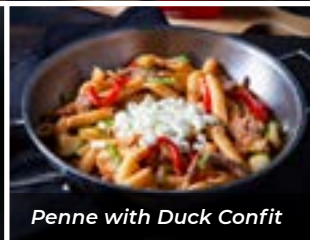
Penne with Duck Confit