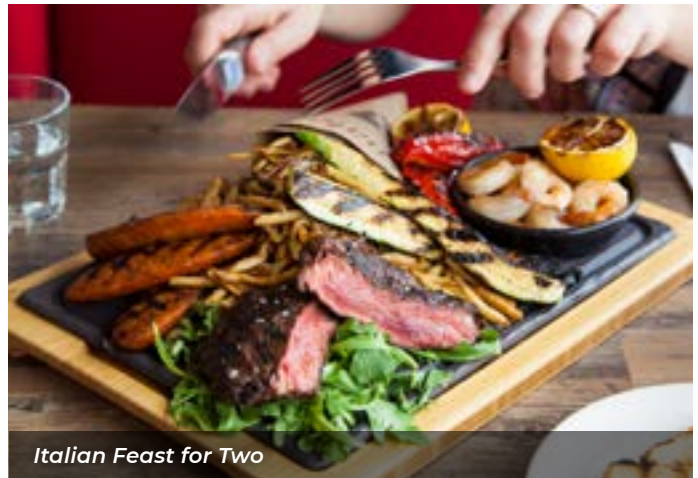
Italian Feast for Two