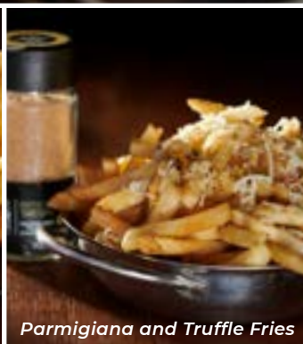
Parmigiana and Truffle Fries