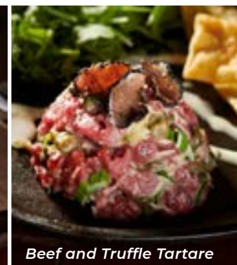
Beef and Truffle Tartare