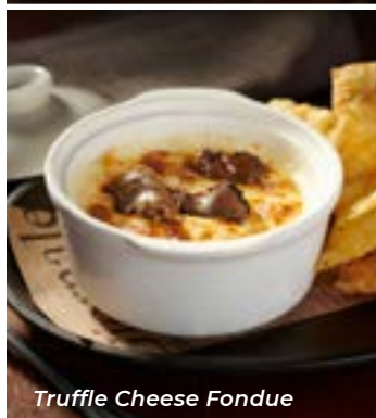
Truffle Cheese Fondue