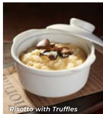
Risotto with Truffles