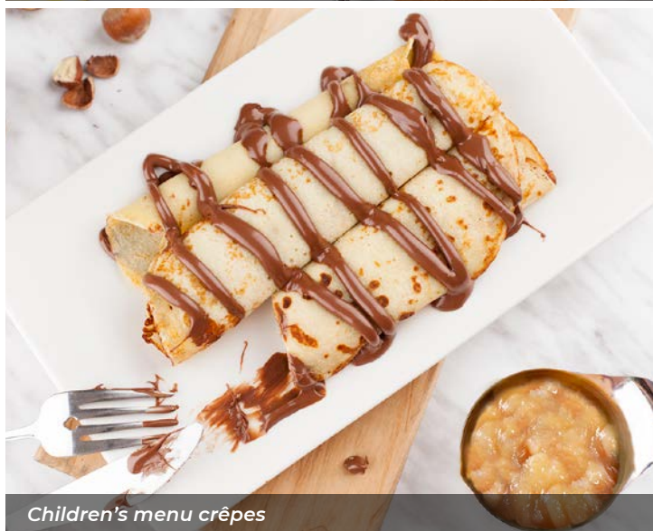
Children's menu crêpes