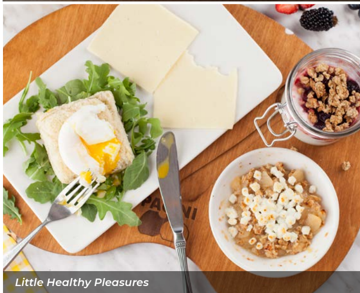
Little Healthy Pleasures