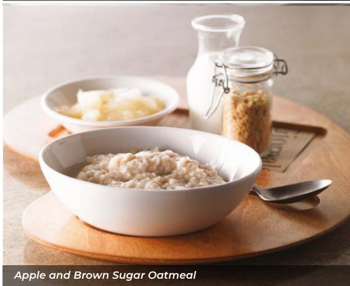
Apple and Brown Sugar Oatmeal