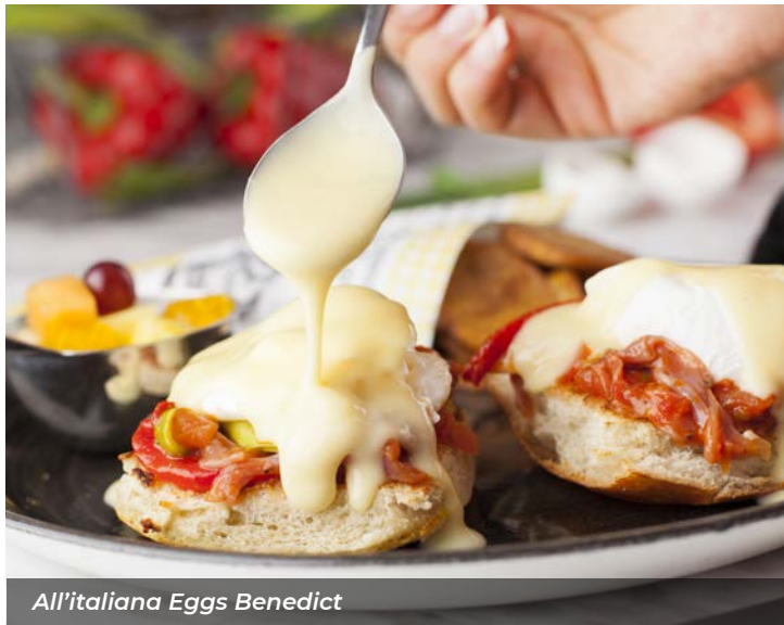
All'italiana Eggs Benedict