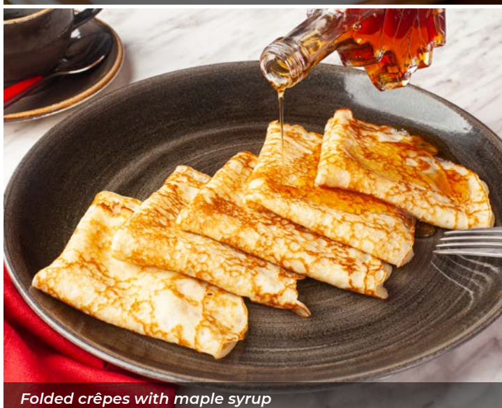
Folded crêpes with maple syrup