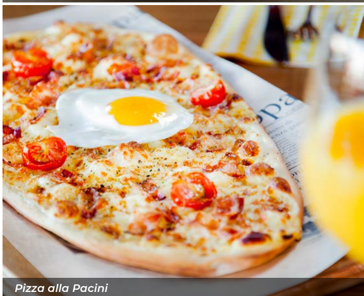
Pizza alla Pacini