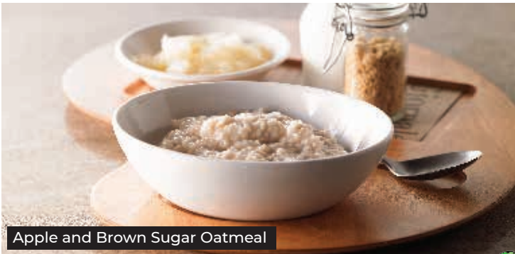
Apple and Brown Sugar Oatmeal