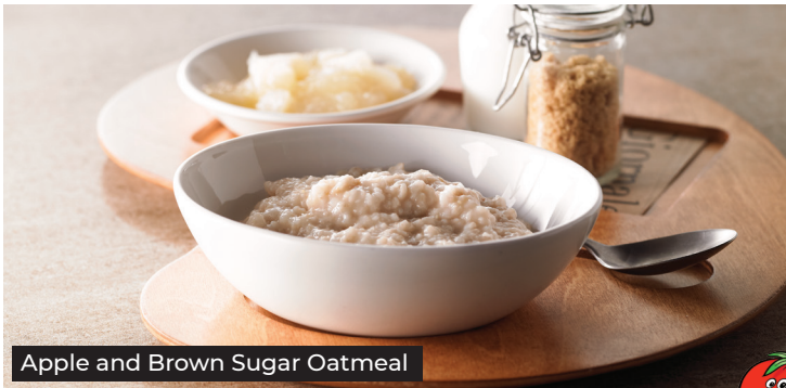
Apple and Brown Sugar Oatmeal