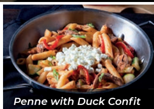
Penne with Duck Confit