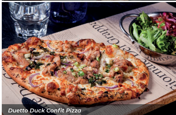
Duetto Duck Confit Pizza