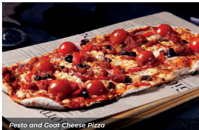
Pesto and Goat Cheese Pizza