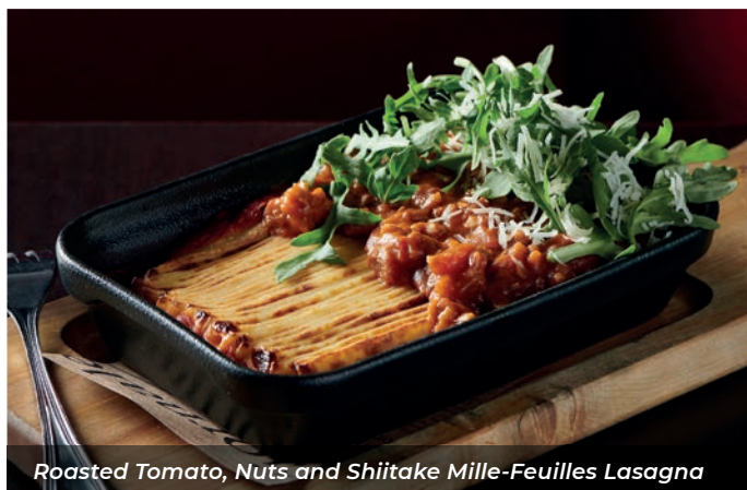
Roasted Tomato, Nuts and Shiitake Mille-Feuilles Lasagna