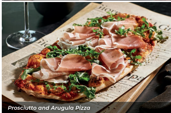
Prosciutto and Arugula Pizza