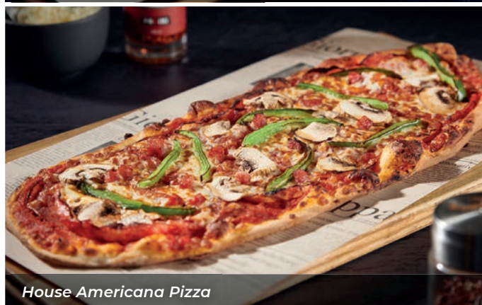
House Americana Pizza