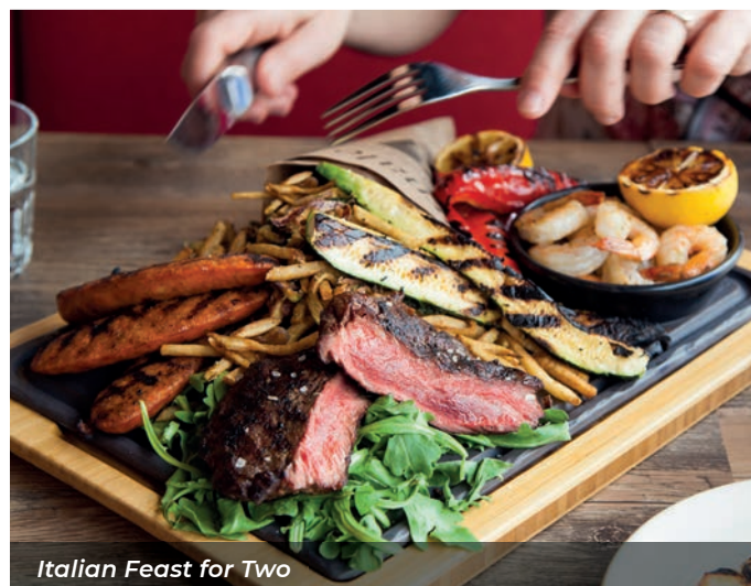
Italian Feast for Two

Prefer gluten-free? To accompany all these grilled dishes (except the Italian Feast for two), in addition to grilled vegetables, replace the fries or linguine with crouton-free Caesar salad or kale al limone salad, or balsamic vinegar glazed vegetables.