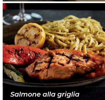
Salmone alla griglia