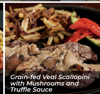
Grain-fed Veal Scallopini with Mushrooms and Truffle Sauce