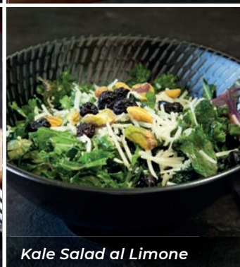
Kale Salad al Limone