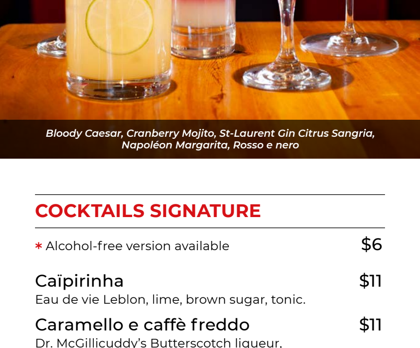
Bloody Caesar, Cranberry Mojito, St-Laurent Gin Citrus Sangria, Napoléon Margarita, Rosso e nero