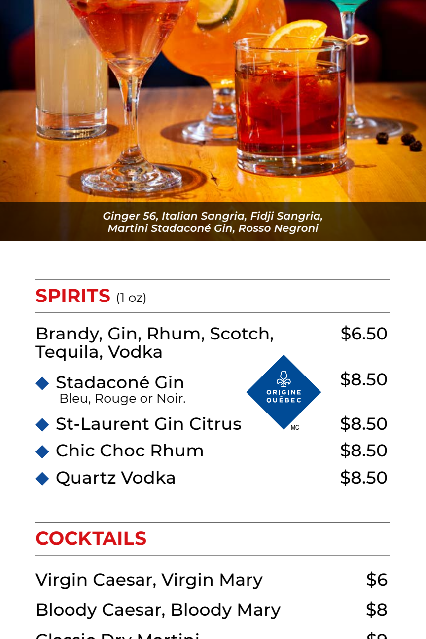
Ginger 56, Italian Sangria, Fidji Sangria, Martini Stadaconé Gin, Rosso Negroni