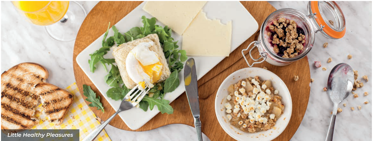
Little Healthy Pleasures