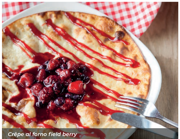
Crêpe al forno field berry