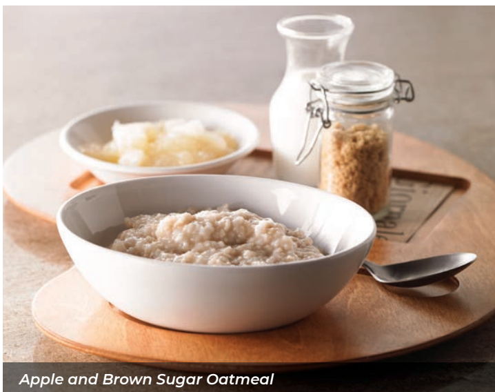
Apple and Brown Sugar Oatmeal