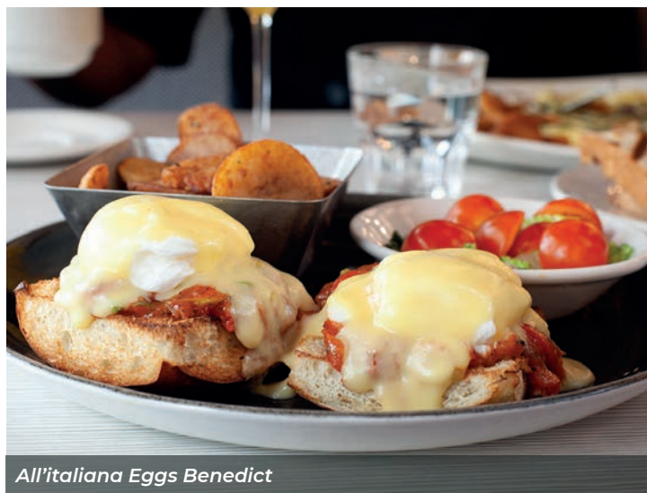
All'italiana Eggs Benedict