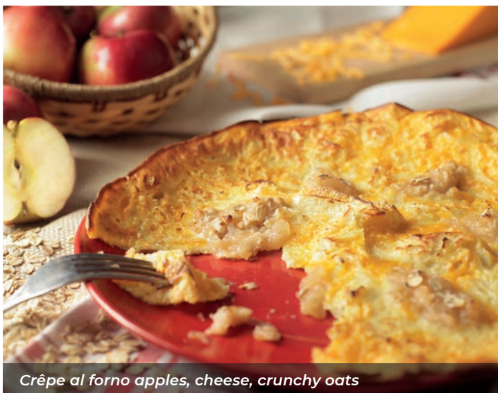
Crêpe al forno apples, cheese, crunchy oats