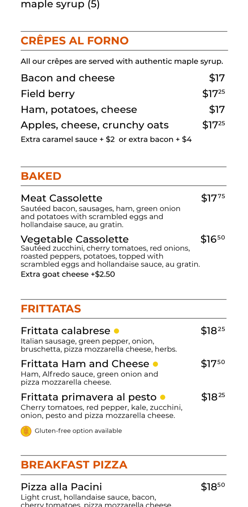
All'italiana Eggs Benedict