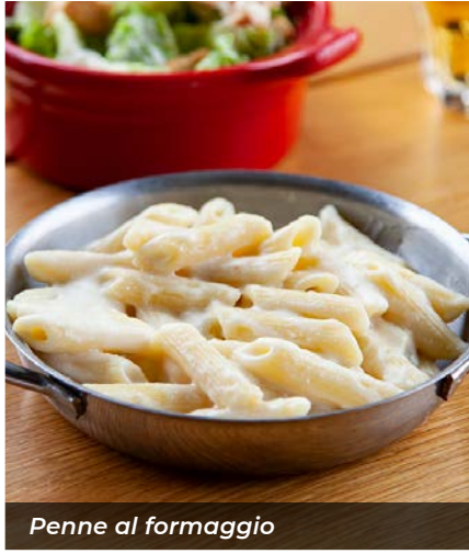
Penne al formaggio