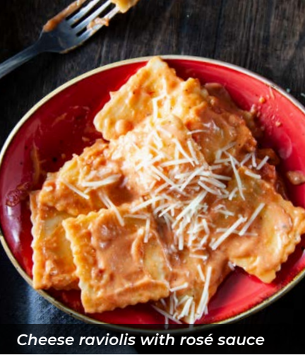
Cheese raviolis with rosé sauce